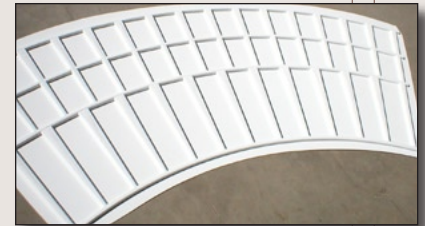
Custom Liner Patterns

In many cases this adaptation to the local surroundings calls for a brick finish. The good news is that brick-clad precast parking structures are an easy feat. In fact, embedded thin brick in a precast parking spandrel performs even better than conventional, laid-up face brick.