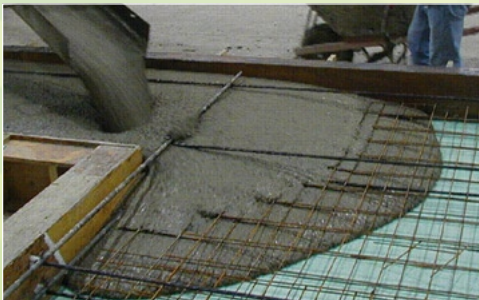
Concrete being poured.