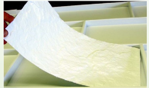
Placing stone inserts into Grid Liner.