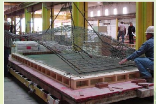
Cage being placed.