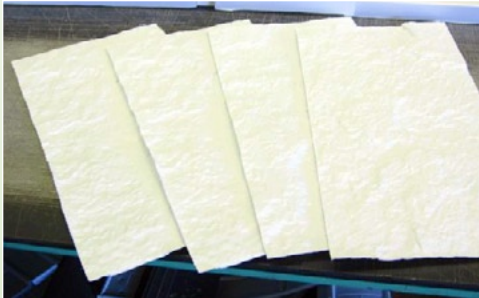
Re-usable Stone inserts.